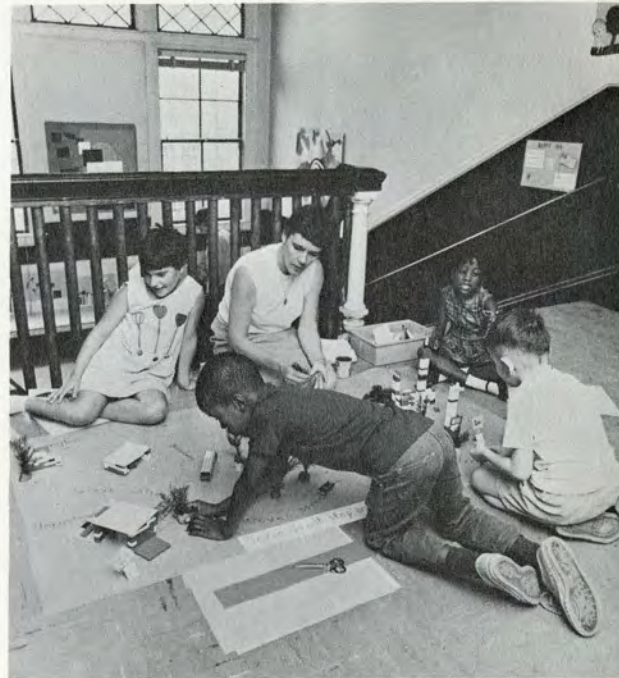
Children and teachers at the Lesley College Summer School were not restricted to classrooms. Here, young students work together in the informal setting of a hall at the Lesley-Ellis School, where the summer program operated. The youngsters were busily engaged in the construction of a model city, with assistance being offered by their “apprentice” teacher.