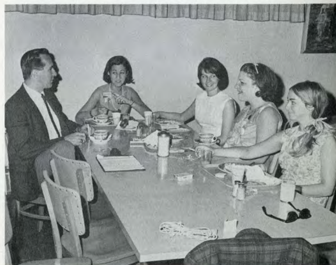
A Lord Newark group "convenes" over a morning cup of coffee . . .