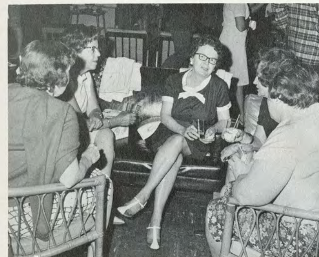
Classmates meet . . .