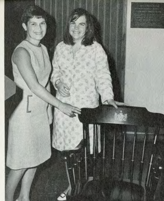
a Lesley College Chair is presented . . .