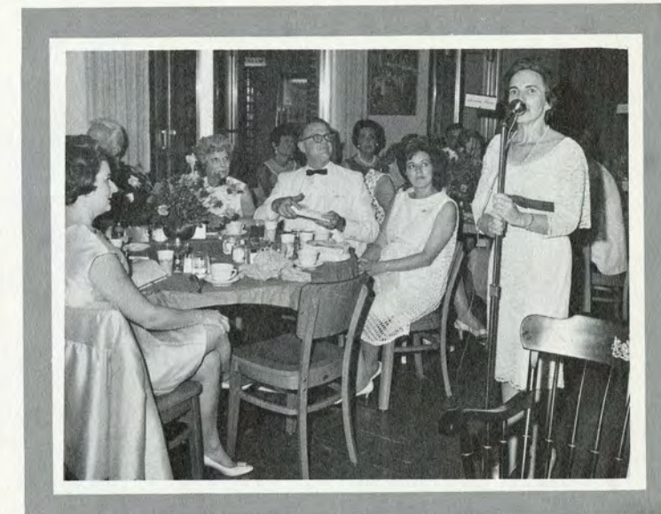
A new President presides . . .