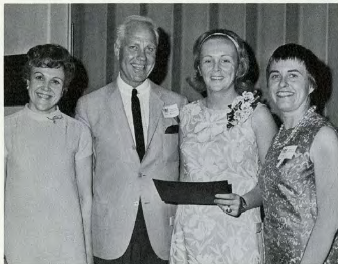
An Alumnae Scholarship is given . . .