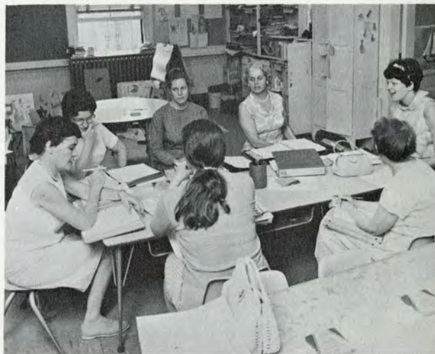
“Apprentice” teachers in the Lesley College Summer School Program gathered in the afternoon of each class day to discuss what had occurred in the morning and to make plans for the following day. The aspiring teachers, all college graduates, came from occupations such as school nursing, relocation work, psychology research, and counseling.