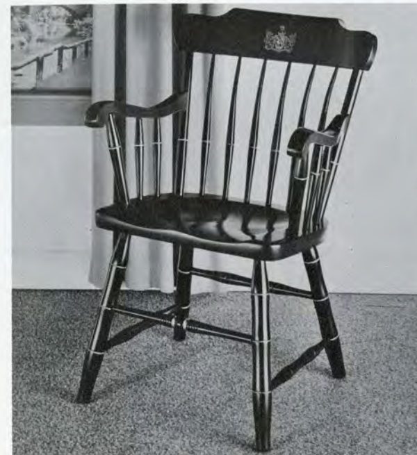
Lesley College Captain's Chair