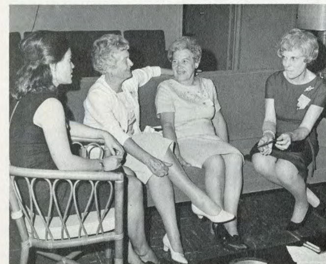
An Alumnae discussion . . .