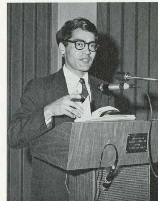
A scholarly presentation . . .