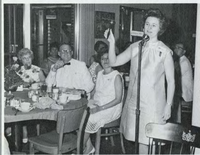
A President turns over her gavel of office . . .