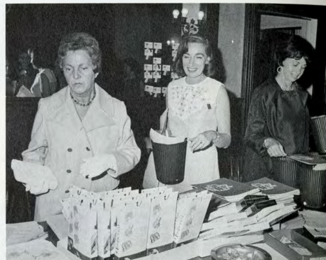
A registration room is filled with weekend guests . . .