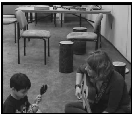
Figure 1. Orientation of Procedure Room

experience using music therapy as an intervention to treat the communicative and social limitations of children diagnosed with autism spectrum disorders. The procedure room, where the music therapy sessions took place, used non-florescent overhead lighting and had no windows. The room contained several folding chairs and two folding tables. Two folding chairs were set up in the mid-point of the room near a long folding table, and the remaining chairs were stacked in a corner of the room. The folding table was placed next to the wall and two chairs stood in front. The orientation of the procedure room is illustrated in figure 1. Various musical instruments and a bag of colored scarves were laid on the table which stood at a fixed height of 25" which allowed all of the children ability to reach and see the instruments. The musical materials included four rhythm sticks, one cabasa, one thunder tube, four jingle bell bracelets, four chickita shakers, two soft mallets, two paddle drums (head size, 10 and 12 inches), one 10 inch tambourine, one 12 inch ocean drum, and six colorful scarves (see figure 2). Placed on the floor approximately one foot from the table were three tubano drums (head size, 10, 12 and 14 inches), and one \frac{3}{4} sized acoustic guitar.