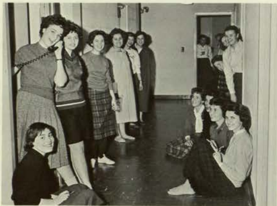
Our happy second floor.