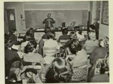
And so you see---