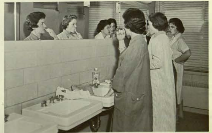
Let's see those Ipana smiles, girls!