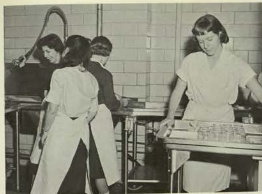
Do a good job.