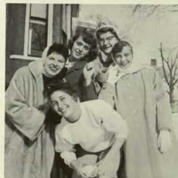
Forever young and gay

President Vice-President Secretary Treasurer Publicity Chairman SGC Representative Advisor