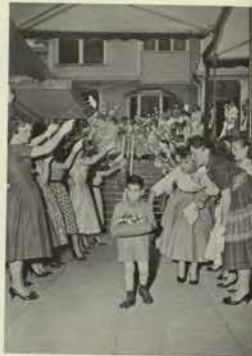
It's just a little further!