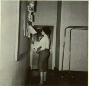
Check the bulletin board-----