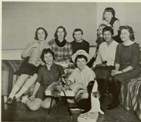
How many pounds has your penquin lost?