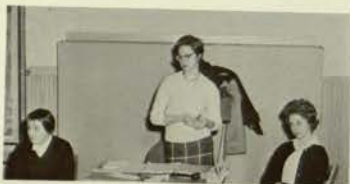
How about a smile?