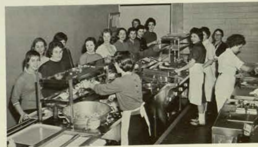
Time to eat.