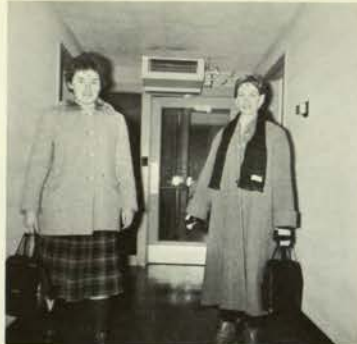
Oh, those eleven o'clock curfews!