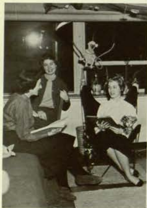
Tell me some more.