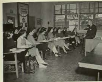
Did I ever tell you---