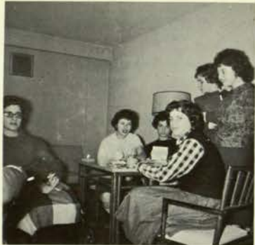
One more for bridge?