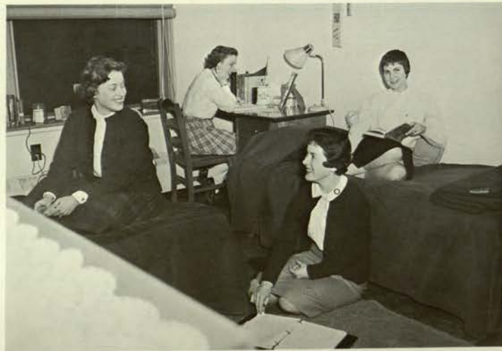
Time to study!