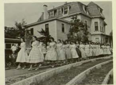
THE SOPHISTICATED Juniors!