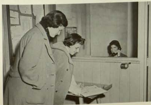
Have a good time!