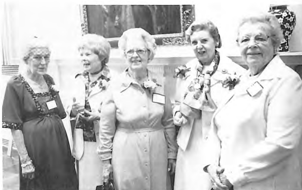
Members of the Class of 1923 returned to Lesley for their 55th Reunion last spring.