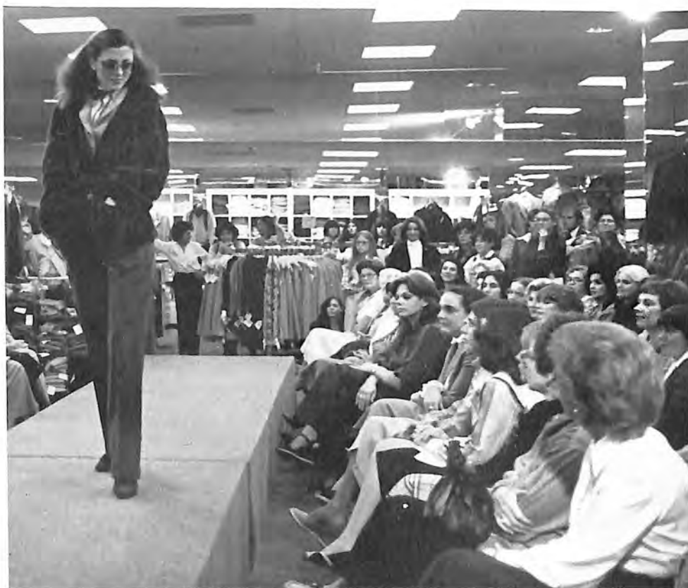
Close to 200 alumni and friends enjoyed the latest in fall fashions Oct. 12, as shown by Bloomingdale's at the new Bloomingdale's Fashion Center, Chestnut Hill, MA. Proceeds benefited the Alumni Scholarship Fund.