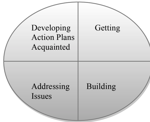
Figure 1. Four Relational Aspects of Circles

building relationships before discussing core issues. This is very intentional and important. This means deliberately delaying discussing sensitive issues until the group has done some work on building relationships. Figure 1 demonstrates the emphasis placed on the principles of the medicine wheel, which teaches about the interconnectedness of life and the principle that all life is composed of cyclical patterns (Pranis, Stuart, & Wedge, 2003 in Boyes-Watson, 2005).